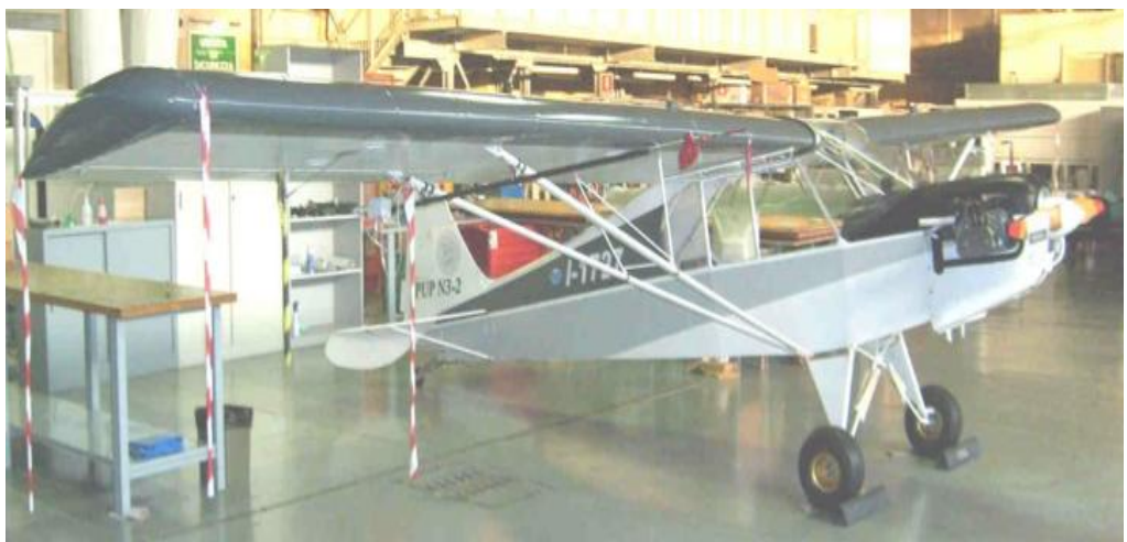
Fig. 1 Flight Research Laboratory L.A.U.R.A.