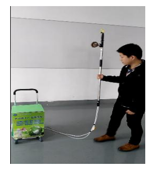
Figure 11 the laboratory test

In order to verify the design of the outdoor advertising cleaning device can achieve all the goals, we carried out a series of laboratory tests and outdoor tests, as shown in Figure 11 and Figure 12. In the actual experiment, the cleaning machine can achieve the goals of cleaning of the advertisement paper on the wall or other clean objects and the realization of the collection of the confetti. In addition, we have done a series of experiments at the newspaper board, the walls covering with all kinds of advertising paper and the effect is significant. We invited some sanitation workers to conduct the field work and get high praise. It has been used in some decoration companies and domestic Service Corporation and get good response. The main technical indexes of the prototype are shown in Table 1, and the parameters can meet the requirement of the actual work.