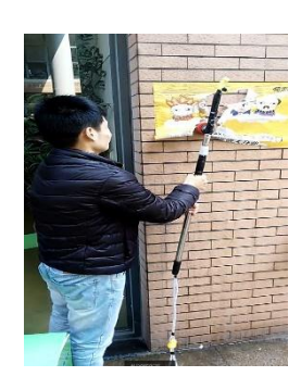
Figure 12 outdoor test