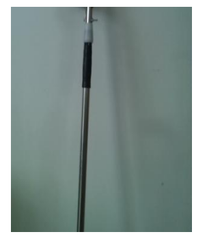
Figure 8. The telescopic rod Figure 9. The nozzle