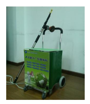
Figure 6. Photo of the prototype

the solution tank fixed in the upper part of the clean-up box, the other part is collecting-box for the scraps of paper fixed in the lower part of the clean-up box. The device of confetti collecting includes the gear motor, the cylindrical brush and the collection box.