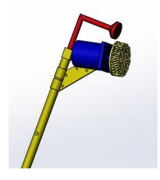
Figure 2: The 3D model of the cleaning-head

The cleaning-head comprises a telescopic rod, a motor fixed on the upper end of the telescopic rod and a brush head connected with the motor. The 3D model of the cleaning-head is shown in figure 4. After the nozzle injecting the organic solvent which can soften the advertisement paper, the motor drives the wire brush to rotate, tearing off the advertisement paper. The brush head including the steel wire brush and the plastic brush which can be replaced according to the different cleaning objects to achieve the protection of the objects.