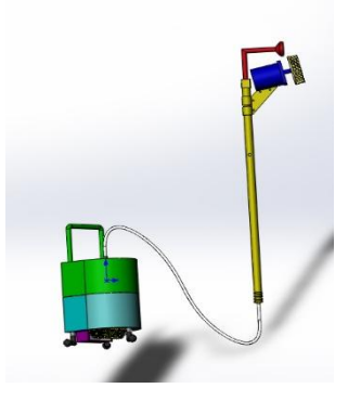
Figure 1: The 3D model of the cleaning device

This outdoor advertising cleaning device proposed in the test, including the clean-up box, the pipelineline and the cleaning-head this three main modules which connected in turn. Its working process is as follows: first of all, the gear motor drives the miniature hydraulic pump, the pump control ta nozzle to inject the organic solvent, softening the advertisement paper on the wall or other cleaning objects. Then, the motor drives the rotation of the spindle, the spindle drive the wire brush to rotate, tearing off the advertisement paper. Finally by the rotation of the cylindrical roller brush driven by the gear motor, pushing the confetti into the confetti collection box, completing the whole operation process. The whole device is powered by the battery (It should ensure the speed of the brush is not lower than 2000 r/min), which is placed in the cleaning box. According to the test, to achieve the goal of low-cost, multi-functional and efficient effect, the water softening device, the cleaning device and the confetti collecting device are set as a whole. Compared with the existing technology, the design of the outdoor advertising cleaning device proposed in this paper has the advantages of simple structure, convenient using, widely range of cleaning, etc.