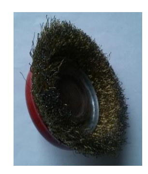
Figure 7. the brush