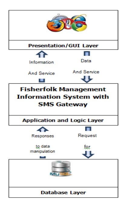
Figure 4.Application Architecture Model of the System.

The presentation layer, often known as the graphical user interface (GUI), integrated the functionalities that allowed the user to interact with the system. The display layer was executed at the web browser via local hosting in the server version of FisherfolkManagement Information System with SMS Gateway. The business layer enclosed the required business logic and implemented the system's principal functionality. The suggested system's data manipulation layer implemented the procedures involving the management of fisherfolks' data. The database, tables, and records were all handled by the My Structured Query Language (MySQL) database server.