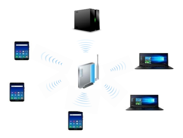
Figure 3. Physical Network Topology of the System