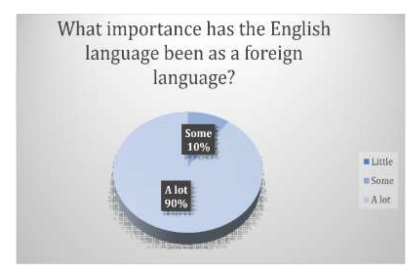
Figure 1. Answers of the questions. Excerpt from the survey.

The role of the student is one of the main changes achieved in language teaching. The students played a more active role as they will be responsible for the level of development of language skills and it is them that must give the greatest effort within the classroom (Ordorica, 2010). This is related to the application of the language in an area that is to your liking and which belongs to the applied areas of your program.