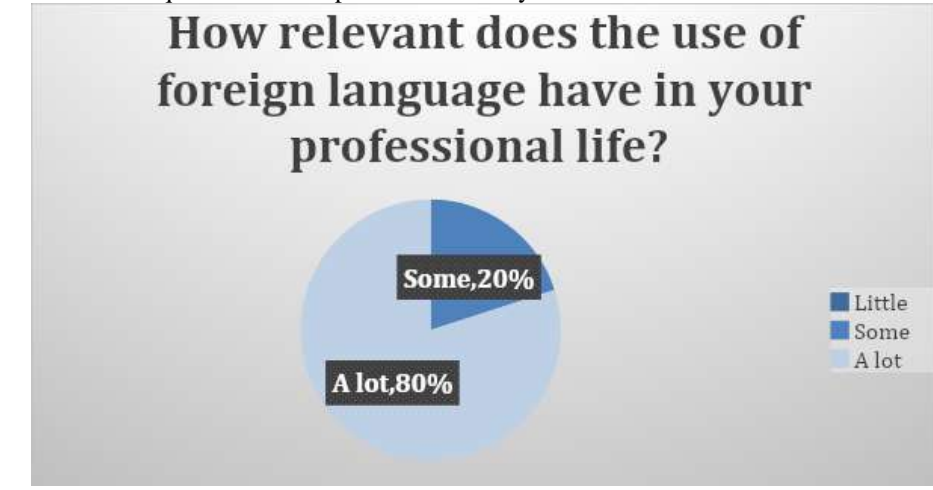
Figure 2. Answers of the questions. Excerpt from the survey.

Figure 2.. Answers of the questions. Excerpt from the survey.