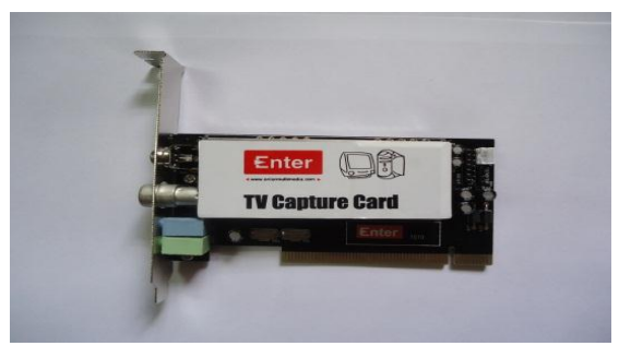
Figure 4: ATI digital TV capture card

The card contains a tuner and an analog-to-digital converter along with demodulation and interface logic.