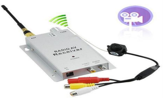
Figure 3: AV Receiver and Wireless Camera

A TV capture card is a computer component that allows television signals to be received by a computer. It is a kind of television tuner. Most TV tuners also function as video capture cards, allowing them to record television programs onto a hard disk. Digital TV tuner card is as shown in the Figure