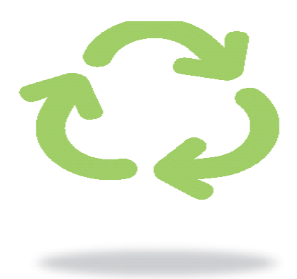
Fig: 6. Recycle E-waste

8. By make use of more efficient components like: