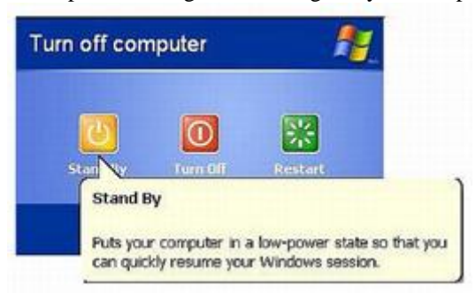
Fig: 5. Stand By mode

4. Enable the standby/sleep mode and power management settings on your computer.