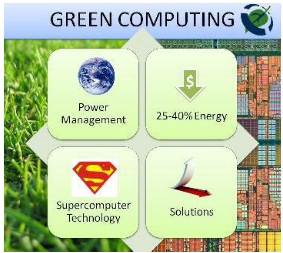
Fig: 2. Green Computing