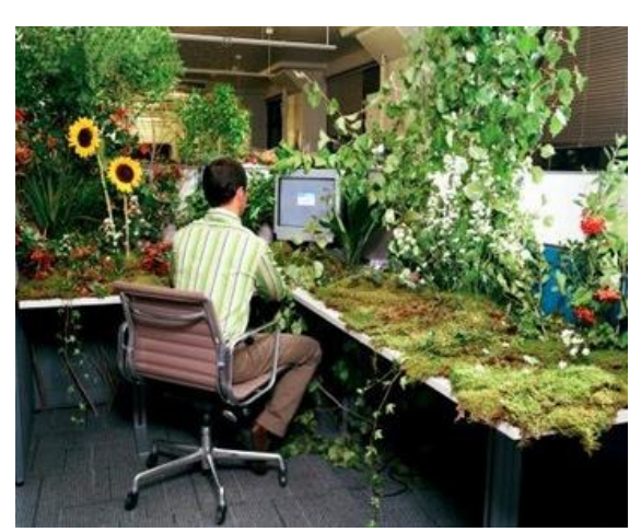
Fig:3. Green Computing Environment

3. Unplug the electronics if not in use: