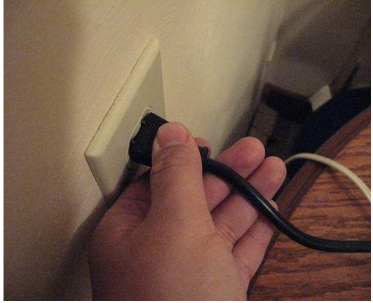
Fig: 4. Unplug the electronics if not in use

All the electronics equipment must be turned off when not in use. This will save energy as well as our electricity bill.