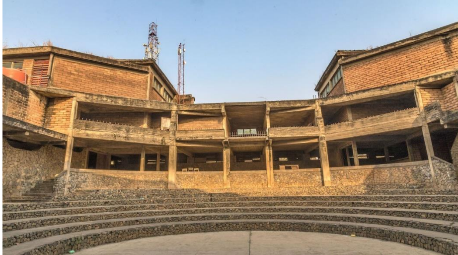
Figure 4. The outdoor theatre where performers can display their works