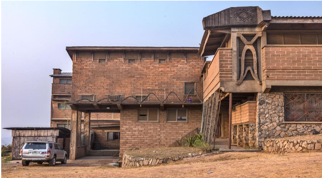
Figure 2. A portion of the Demas Nwoko-designed and -built New Culture Studio building.

The majority of Nigerians are still residing in colonial master's mansions nearly 60 years after the country's independence, yet this Ibadan home is nevertheless a shining example of how ancient technological advances in construction may be improved by modern creative architecture as demonstrated in Figure 3 below.