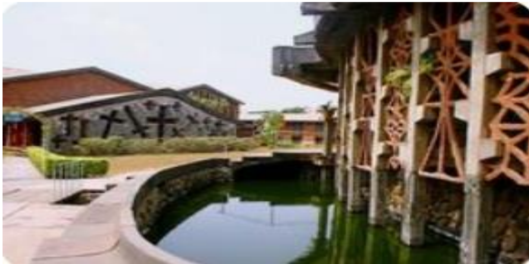
Figure 7. Dominican Chapel, University of Ibadan, Nigeria

Some have massive columns supporting extraordinarily high ceilings, while others include impluvium mechanisms that provide fresh air from openings. Their majesty coexists with a feeling of seclusion and soft tenderness