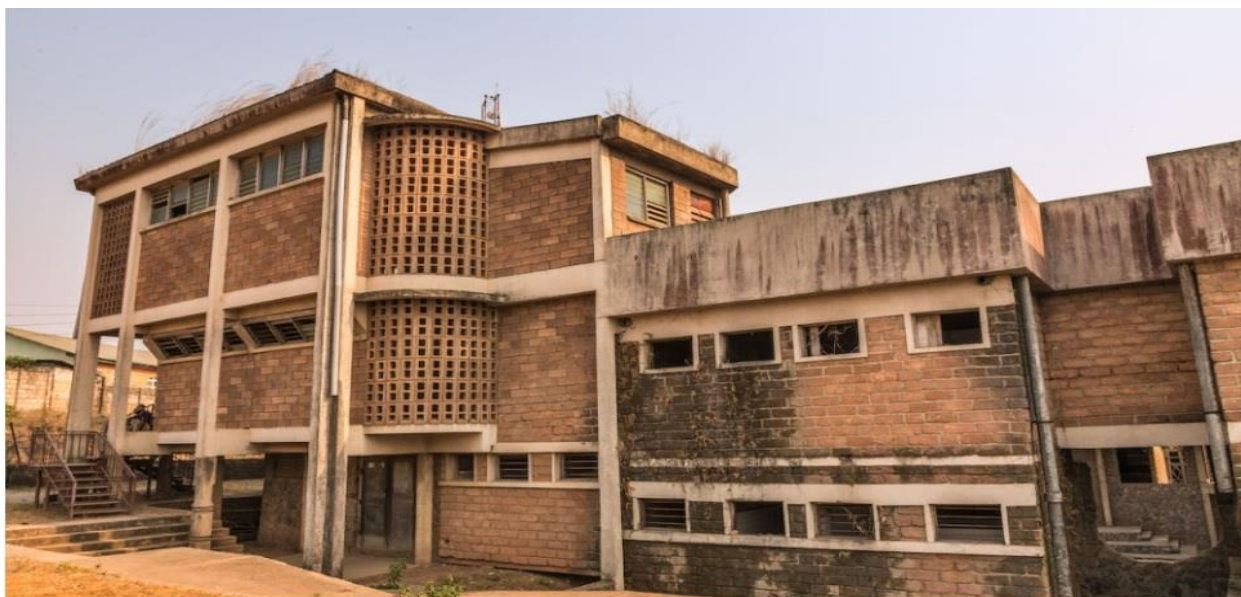
Figure 6. New Culture Studio – An example of Institutional Building in Sustainable Architecture

He recalls that the country began to get financial aid when valuable natural resources were discovered. Foreigners mined and shipped certain types of crude oil without employing local labour. Because they were supported by government handouts and scholarships made possible by money they had not earned, the succeeding generations had a weaker sense of community.