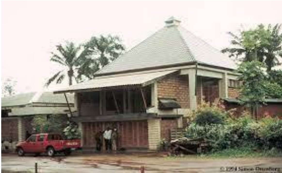
Figure 8. Residence of Demas Nwoko at Idumuje-Ugboko, Nigeria

Nwoko wonders if sustainable development could be a measurable indicator of actual sovereignty. "Independence is to become ourselves," she argues.