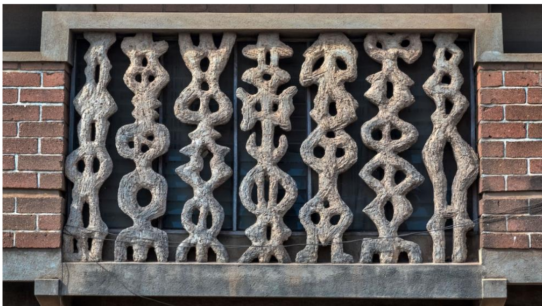
Figure 5. A close-up view of the New Culture Studios

After calculating the financial implications associated with importing building materials, the Oyo State government began creating its own models of inexpensive housing using mud bricks in 1976. By using domestic coconut and palm timbers as rafters, officials hoped to show how using natural resources could be a practical and more cost substitute for concrete. Rich indigenous art is demonstrated in Figure 5.