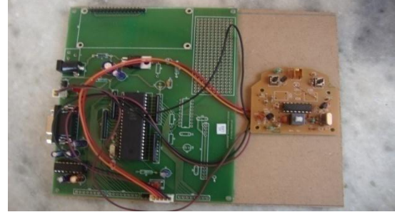
Figure 4.2 Controlling Section

The controlling section consists of an ATMEL Microcontroller, RF transmitter and Personal computer. The ATMEL Microcontroller is connected to the personal computer by using a RS232 cable and Windows HyperTerminal. The RF Transmitter is connected to the port pins of the micro controller. The RF section is useful for controlling the movement of the vehicle. This is done by connecting it to the hyper terminal of the computer.