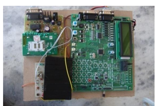
Figure 4.1(a) Top section of Vehicle section