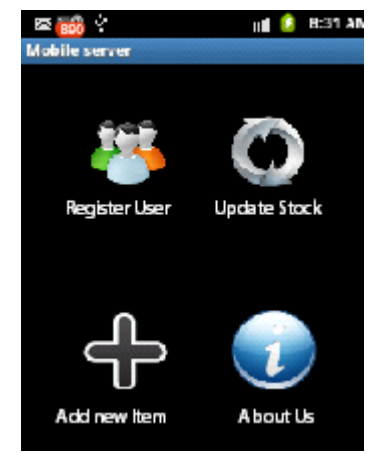
Figure 2: Mobile server with different options.