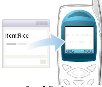
Figure 7: User Request

The following fig. 7 shows the user registered already with the data server of a store, requesting an item by sending a message in the format Item:Rice to the mobile data server. The user side device can be of any type (android /non-android).